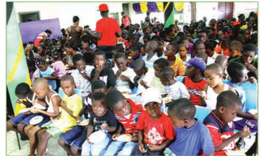
Some of the children who shared in the Christmas Treat..