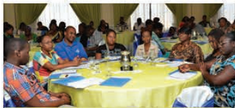
Section of the staff in attendance at the Annual Retreat, held on Saturday, February 16, 2013 at the Knutsford Court Hotel, Kingston.