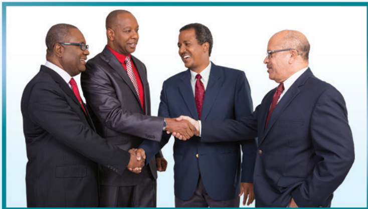
Officers of NWCCUL and C&WJCCUL celebrate the merger.

“The merger will result in the transfer of the assets and liabilities of the NWCCUL to C&WJCCUL, making C&WJCCUL the second largest Credit Union in Jamaica in terms of assets.”