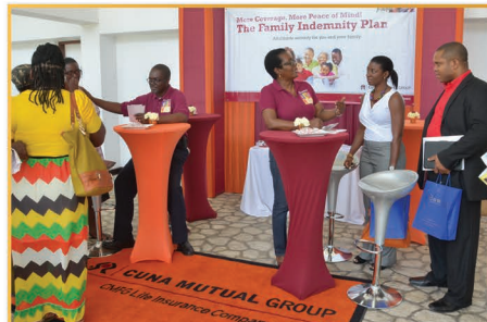
Other groups at the AGM Customer Service Village included: CMFG Life, Cuna Mutual Group, and Credit Union Fund Management Co.