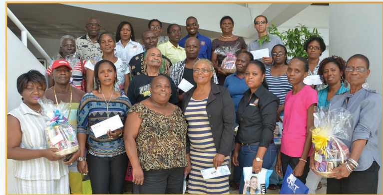
Lucky members pose with their gifts and prizes which were kindly donated by: