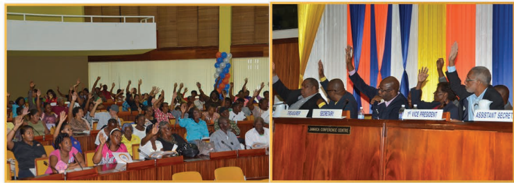
Members and Directors at the 50th AGM voting to change the name of the Credit Union from C&WJ Co-operative Credit Union, to Community & Workers of Jamaica Co-operative Credit Union.