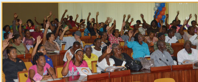
Members at the 50th AGM voting to change the name of the Credit Union.

At the 50th Annual General Meeting (AGM) of C&WJ Co-operative Credit Union Ltd., held on May 30, 2014 at the Jamaica Conference Centre, members voted for the Credit Union to be named Community & Workers of Jamaica Co-operative Credit Union Ltd. (C&WJCCUL), a name which more appropriately reflects the membership base of the Society.