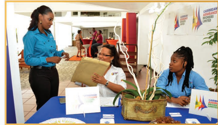
Caribbean Assurance Brokers at the AGM Customer Service Village.