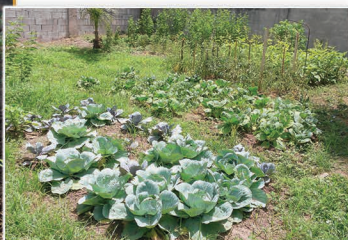
One month later. The team planted callaloo, red and green cabbage, pakchoi, sweet pepper, tomato and pepper mint.